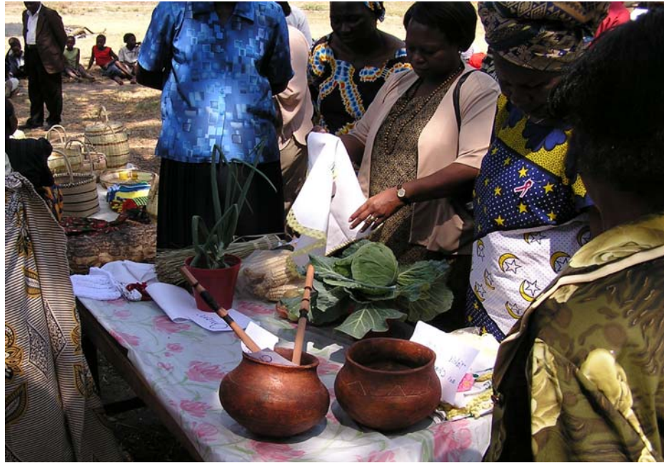
BA MP BEEBELA MILIMO YA SHINTU SHAKATONDEZHIWA KU CRAFT FAIR