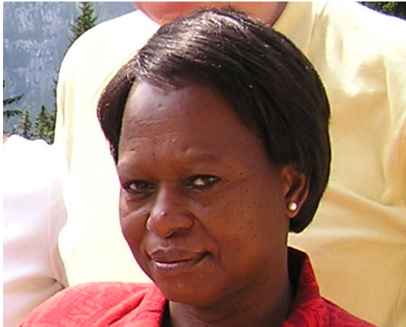
HON. OMPIE NKUMBULA-LIEBENTHAL MP